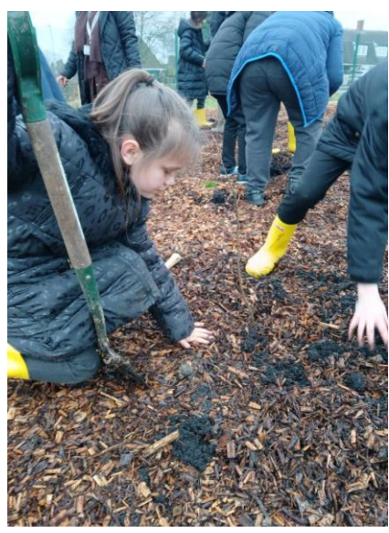
Planting Leicester's 30<sup>th</sup> Tiny Forest at Eyres Monsell Primary School

This is an important eBulletin with lots of things to sign up for, including FREE books and a fabulous tree art competition. We have lots of exciting events and training planned for the next few months so read on to find out more!