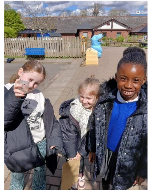
Students from Montrose School minibeast hunting

Grow Your Own Grub Celebration Abbey Pumping Station – Saturday 6 July