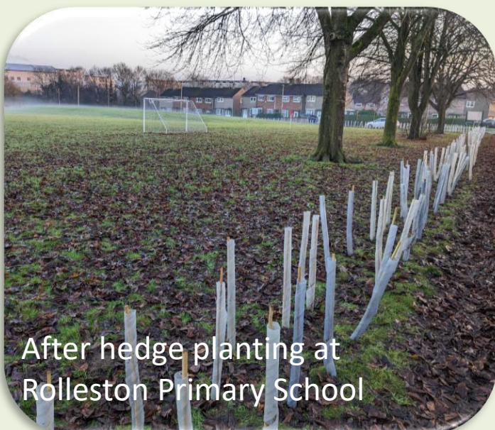
After hedge planting at Rolleston Primary School