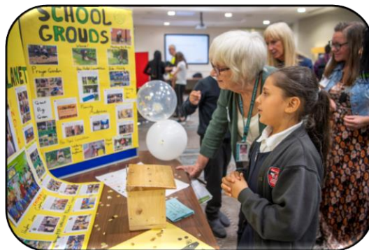
Sacred Heart Voluntary Academy students at our Eco-Schools celebration