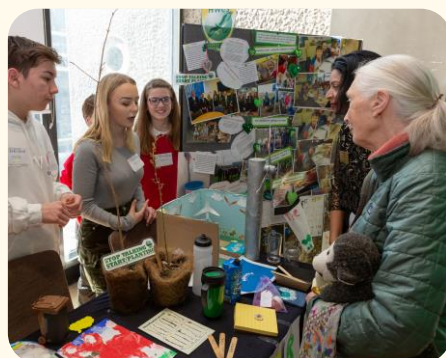
Harrow Way Community School and Portway Junior School are Roots & Shoots members through partnership with ATU.