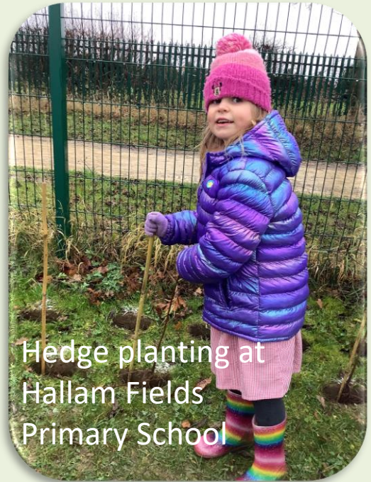
Hedge planting at Hallam Fields Primary School

The project will create ponds, and hedgerows, and install nest boxes. These habitats will help to support our key species of hedgehogs, swifts, redstarts, reptiles, and amphibians.