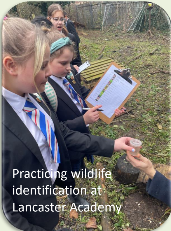
Practicing wildlife identification at Lancaster Academy

We're really excited to be running this project with schools, as it fits into Leicester's Biodiversity Action Plan through habitat enhancement and creating awareness and understanding among students about the importance of biodiversity.