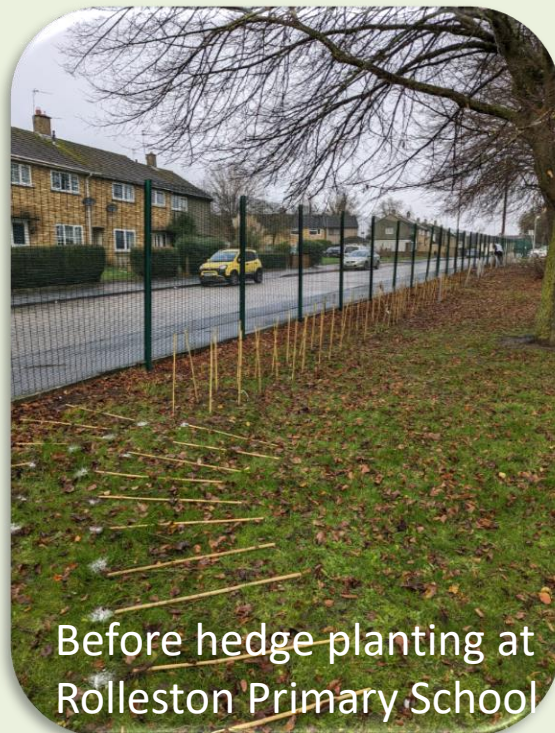
Before hedge planting at Rolleston Primary School

In the New Year they will be making changes to make their grounds better for hedgehogs.