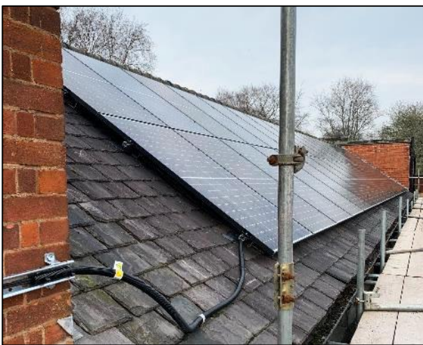
Beaumont Leys School has also had their new solar PV panels fitted by installer, Ineco Energy.