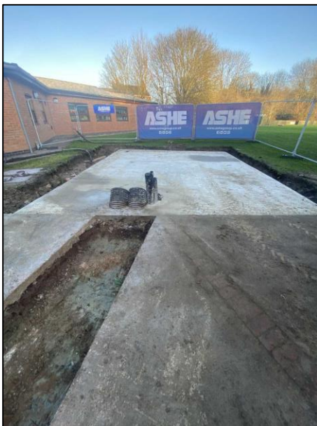
Beaumont Lodge Primary School

Recently, Ashe Construction laid concrete foundations for Air source heat pumps at Beaumont Lodge Primary School and Evington Leisure Centre, in preparation for Air source heat pumps which will be installed in the upcoming weeks.