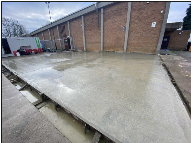
Evington Leisure Centre