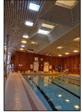
Spence Street Pool