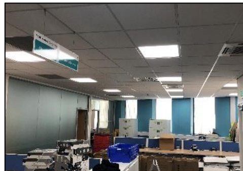
New LED lighting