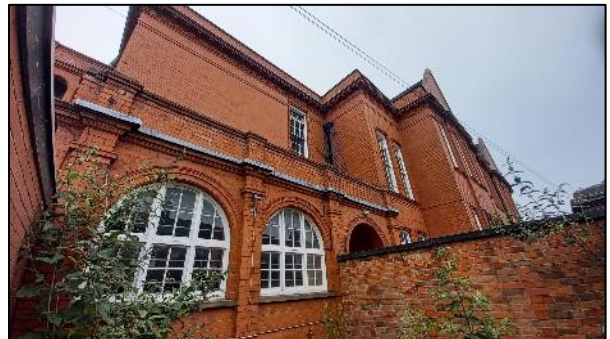
Fosse Neighbourhood Centre