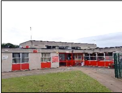
Sandfield Close Primary School

Contractors on behalf of the City Council have now completed site surveys which took place to determine the feasibility of energy efficiency measures at all Salix project sites. Sites surveyed in the last two weeks included Sandfield Close Primary School, Spence Street Gym and Pool, and Fosse Neighbourhood Centre.