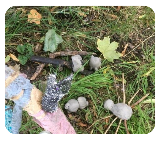
Outdoor learning training which took place at Merrydale Junior School in August 2017

Finished reading? Pass on to a colleague