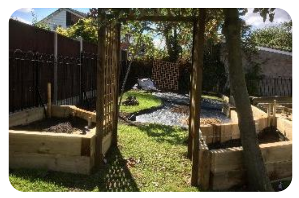
These amazing photos are from Mayflower Primary and their mindfulness garden which is being built by the Leicestershire & Rutland Wildlife Trust