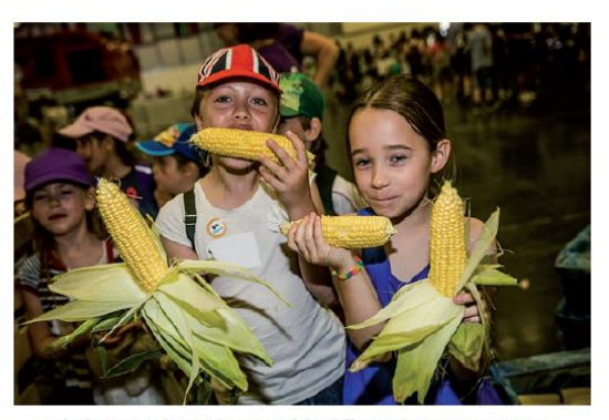
"The huge number and variety of the different things was amazing; One of our best school visits we have taken pupils to." - Alameda Middle School

East of England Showground, Peterborough, PE2 6XE