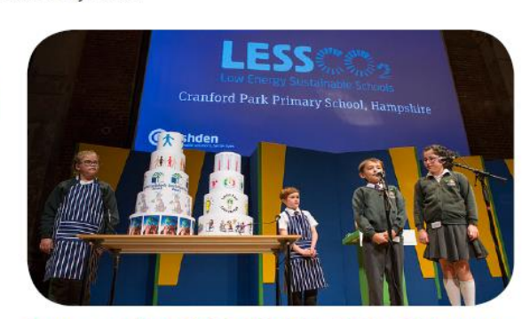
84% say that LESS CO2 has helped them to reduce energy use in their school.

150+ schools have completed the programme, and we will work with 3,000 UK schools over the next 5 years.